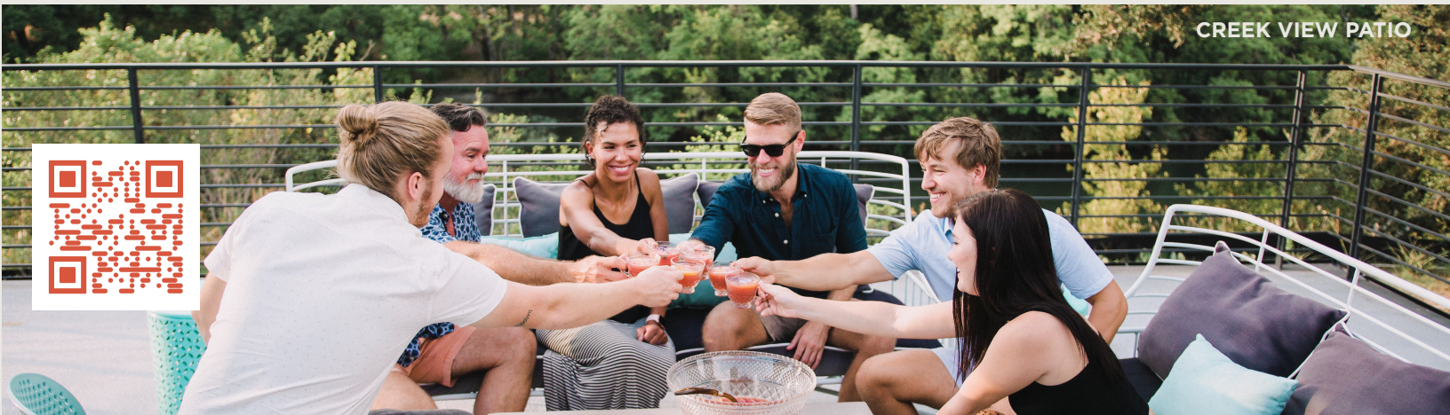
CREEK VIEW PATIO