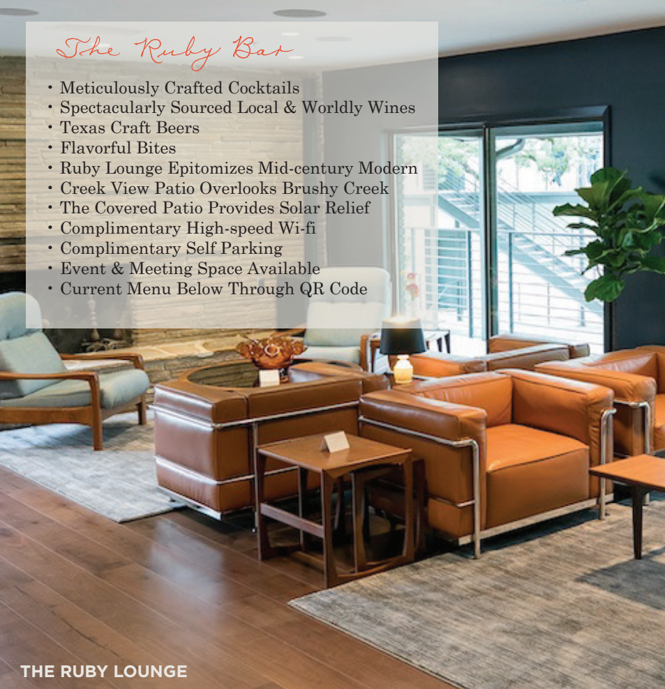
THE RUBY LOUNGE